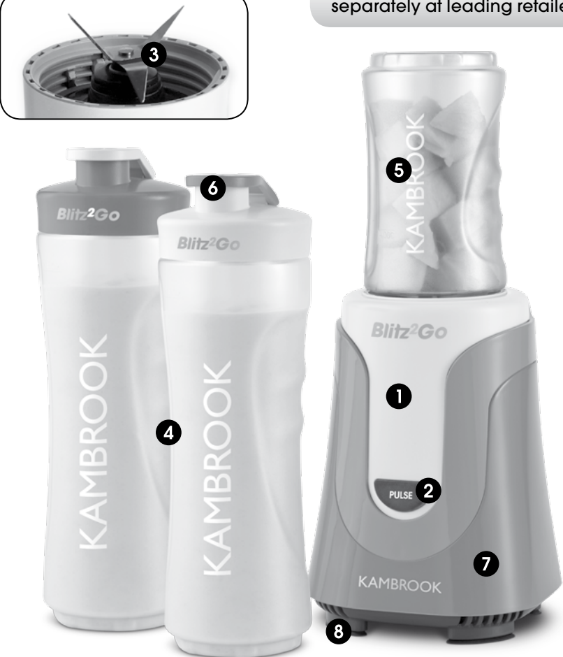
KBL20 Model Shown

NOTE: Additional 600ml bottles (product code KBB2) and 300ml bottles (product code KBL001) are also available to purchase separately at leading retailers.